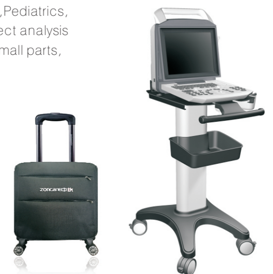
Optional trolley and suitcase